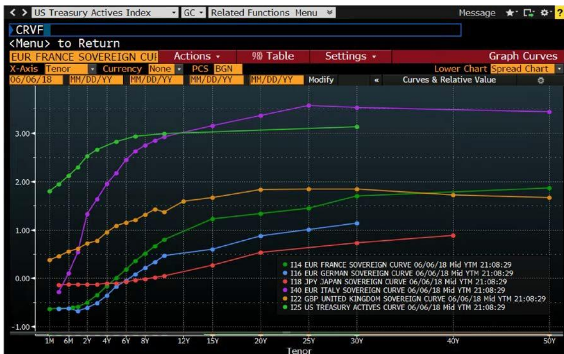
Figure A.1. International Yield Curves

Note: The graph shows yield curves for the U.S., Germany, Japan, U.K., France, and Italy on June 6, 2018.