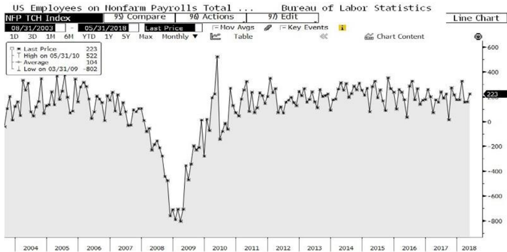
Figure A.6. Monthly Change in Nonfarm Payroll Employment, 2003 to 2018

Note: The graph shows the net monthly change in nonfarm payroll employment. The damage to the labor market from the financial crisis is readily apparent.