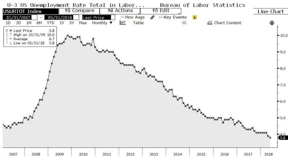
Figure A.7. Unemployment Rate, 2007 to 2018

Note: The graph shows the civilian unemployment rate from 2007 to 2018, illustrating the sharp rise in unemployment during the financial crisis and its slow decline in the recovery.