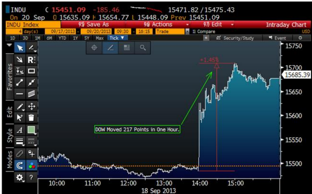
Figure A.3. The Dow jumped up in response to the Fed’s “No-tapering” announcement in September 2013

Note: The Dow stock index jumped up sharply when the Fed surprised markets by not announcing tapering at its September 2013 meeting.