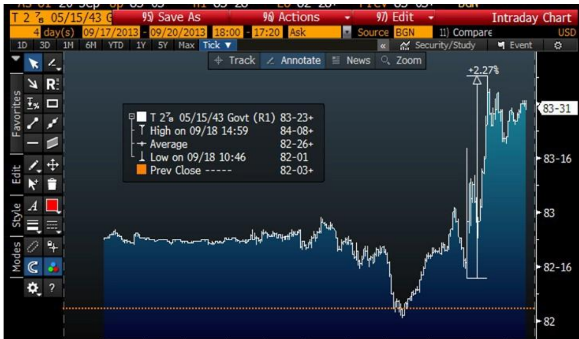
Figure A.2. 30-Year bond price responds to Fed’s “No-tapering” announcement in September 2013

Note: The price of the 30-year Treasury bond jumped up sharply when the Fed surprised markets by not announcing tapering at its September 2013 meeting.