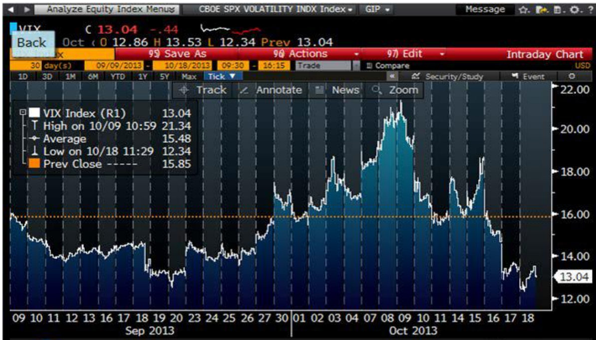
Figure A.10. VIX index, September 9 to October 18, 2013

Note: The graph shows the volatility index (VIX) rising as the threat of a government shutdown increased and falling when the agreement was reached to avert a shutdown.