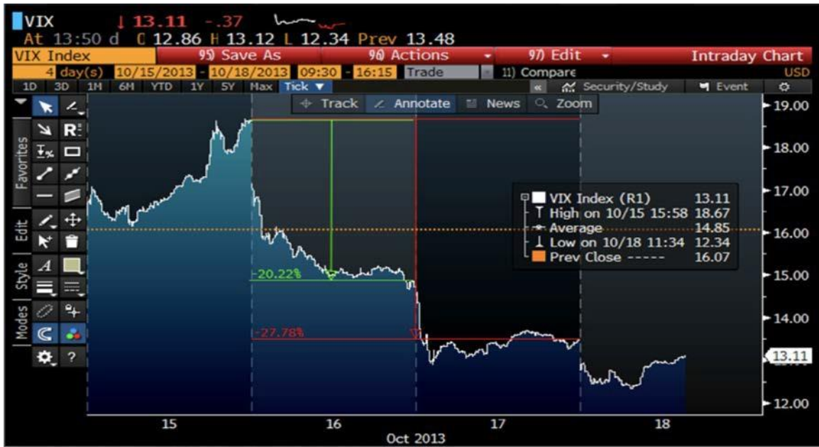
Figure A.11. VIX index, October 15 to 18, 2013

Note: The graph shows the volatility index (VIX) from October 15 to 18, 2013, when the government agreed to end the shutdown.