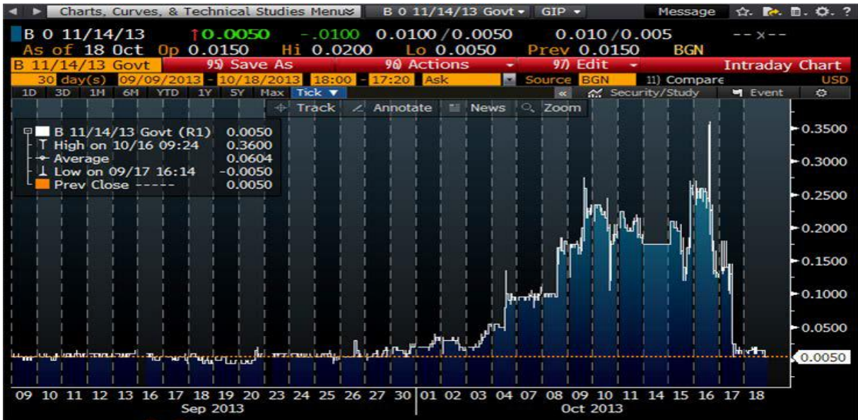
Figure A.9. Interest rate on bond maturing in November 2013

Note: The graph shows the interest rate on a US Treasury bond maturing in November 2013, showing the rise in the yield because of fear that the government might default on its payments.