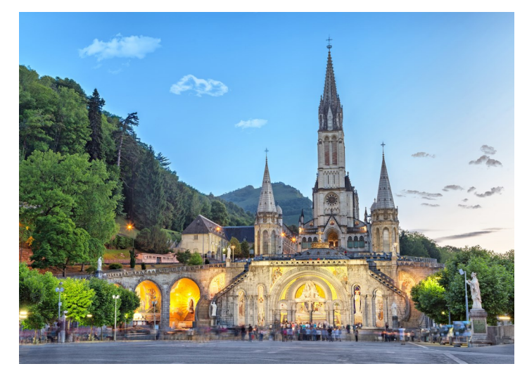
Rosary Basilica ~ Lourdes