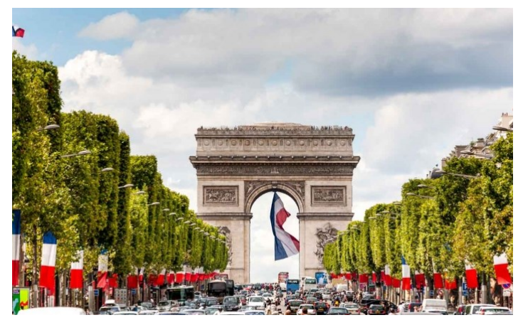
Arc de Triomphe ~ Paris