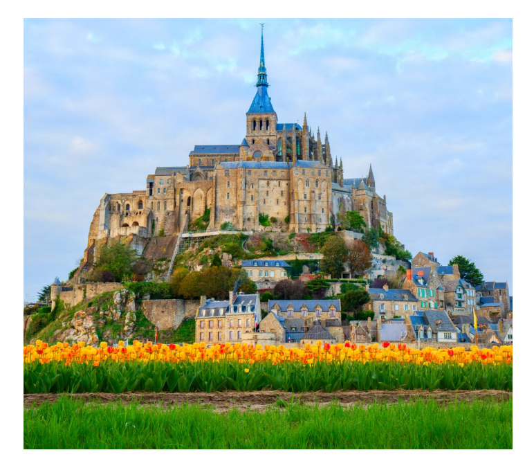
Mont St. Michel